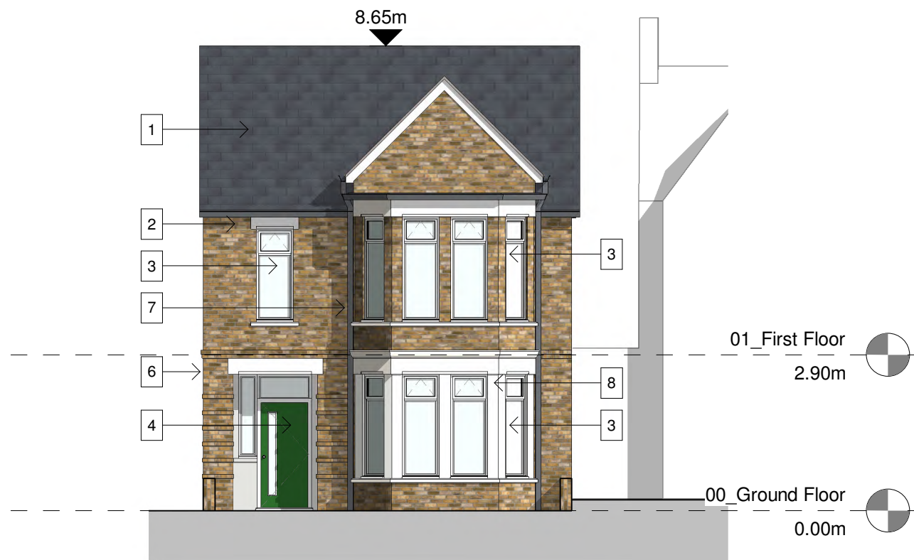
House 2 Elevation 1 1 : 100

Notes This drawing may be scaled for the purposes of Planning Applications, Land Registry and for Legal plans where the scale bar is used, and where it verifies that the drawing is an original or an accurate copy. It may not be scaled for construction purposes. Always refer to figured dimensions. All dimensions are to be checked on site. Discrepancies and/or ambiguities between this drawing and information given elsewhere must be reported immediately to this office for clarification before proceeding. All drawings are to be read in conjunction with the specification and all works to be carried out in accordance with latest British Standards / Codes of Practice.