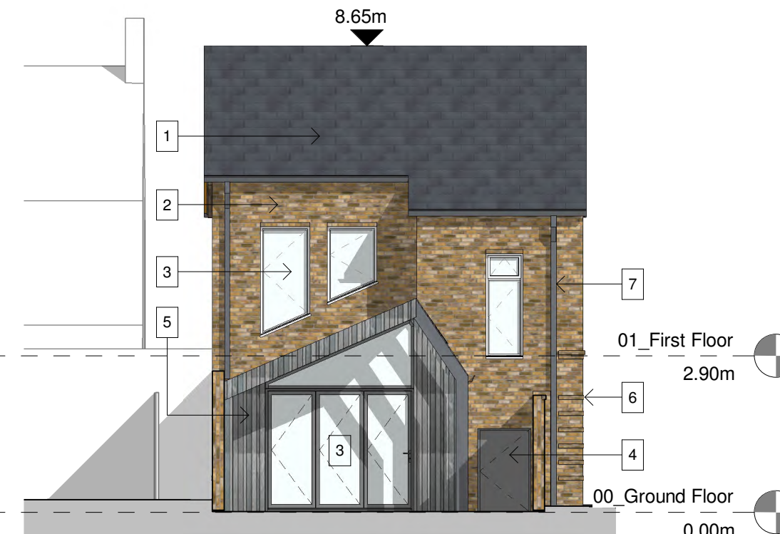
House 2 Elevation 4 1 : 100